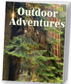
Connect to Technology Outdoor Adventures

Big Idea There are different kinds of communities.