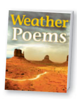
Connect to Poetry Weather Poems