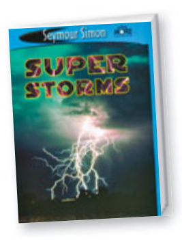
Main Selection Super Storms