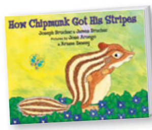
Main Selection How Chipmunk Got His Stripes