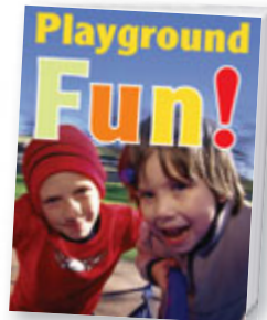
Connect to Science "Playground Fun!"