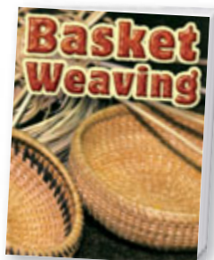
Connect to Social Studies "Basket Weaving"

Big Idea Living things change over time.