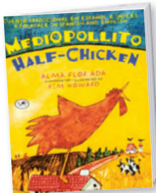
Main Selection Half-Chicken